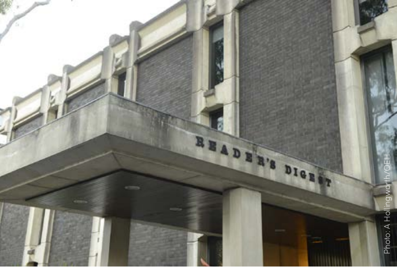
The exterior of the Reader's Digest Building