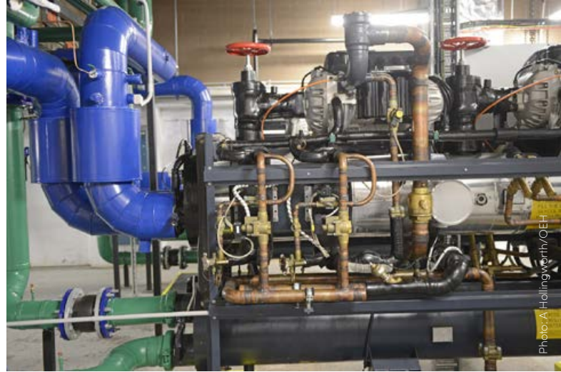
Energy efficient water-cooled glycol chiller

The project involved a heating, ventilation and air conditioning (HVAC) upgrade including replacing two aging chillers and installing variable speed drives (VSDs) on water pumps, and a complete lighting upgrade which involved changing more than 1500 fluorescent lights to energy efficient light emitting diode (LED) lights while maintaining the aesthetics and ambience of the building. We also installed a state-of-the-art energy monitoring system to support a new building management system (BMS).